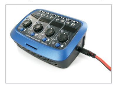
Using DC cable attaching to car battery